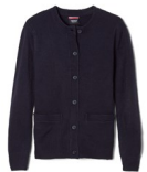
Anti-Pill Crew Neck Cardigan Sweater $23.98 – $30.98