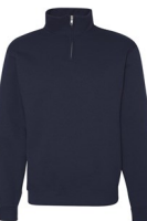
Jerzees - Nublend® Quarter-Zip Cadet Collar Sweatshirt $20.75 – $30.75 $16.60