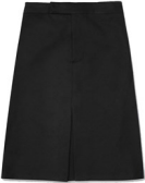
Kick Pleat Skirt $16.98 – $18.98 $6.99

Stylish and modest, this below the knee skirt is the perfect choice for those "longer" dress codes.